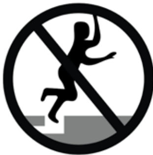
Avoid Drain Covers