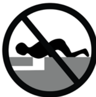
Avoid Body Entrapment