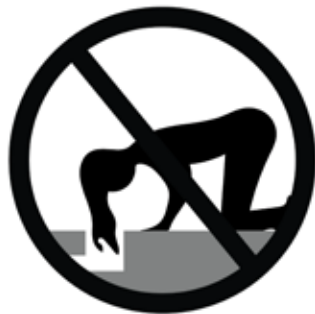
Avoid Hair Entanglement