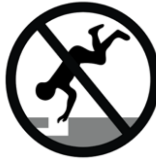
Avoid Finger Entrapment